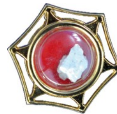
St. Michael Relic Stone from Monte Sant'Angelo on Mount Gargano, available for $15 USD from StMichaeltheArchangel.info (Be wary of the mortal sin of Simony if over-paying from other sellers.)

Most Sacred Heart of Jesus, have mercy on us. (3x) Immaculate Heart of Mary, pray for us. St. Joseph, pray for us.