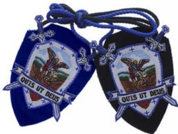
Vintage 1800s styled St. Michael Shield Scapular, from RoseScapular.com

Cor Iesu Sacratissimum, miserere nobis. (ter) Cor Immaculatum Mariae, ora pro nobis. Sancte Ioseph, ora pro nobis.